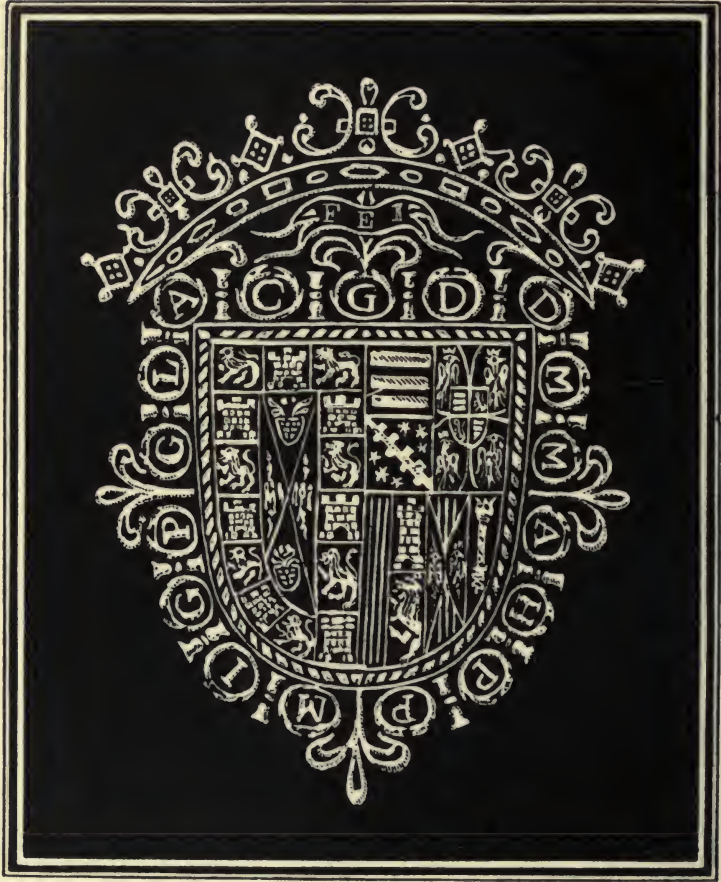
EMPEROR CHARLES V OF GERMANY.